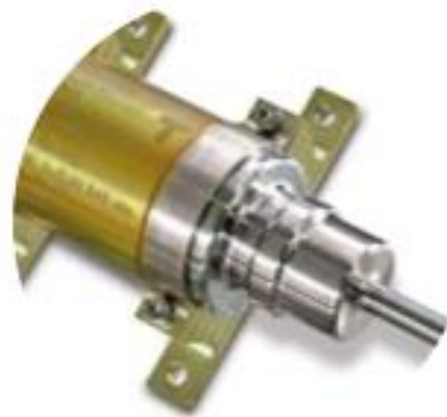
Chemical Propulsion - Components