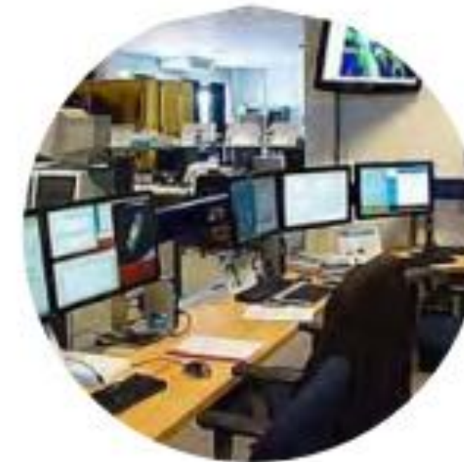
System Modelling and Simulation Tools

The Roadmaps (RMs) and Technology Harmonisation Dossiers (THDs) have been updated, as appropriate, following the Roadmap Meetings to reflect discussions and agreements. Roadmaps proposed for the next 3 to 6 years.