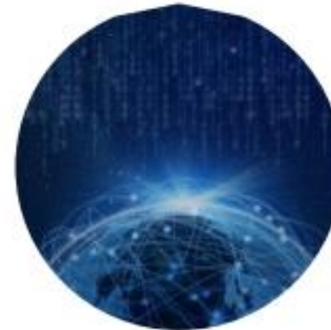
Big Data from Space